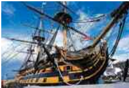
PORTSMOUTH HISTORIC DOCKS