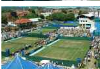
DEVONSHIRE PARK THE LONDON EYE